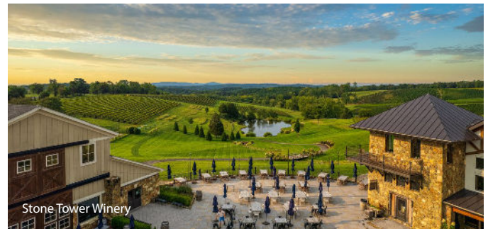
Stone Tower Winery

Ben Lomond Historic Site and Old Rose Garden - Built in 1832, Ben Lomond is a Federal-style house near the site of the First and Second Battles of Manassas and served as a field hospital during the Civil War. Visitors can explore the house (littered with soldier graffiti), slave quarters, dairy, and smokehouse to learn about antebellum life and the Civil War. The site also features an antique rose garden, one of the largest public gardens devoted to antique roses in the U.S.