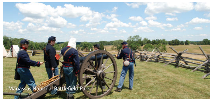
Manassas National Battlefield Park