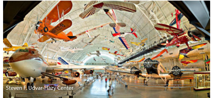
Steven F. Udvar-Hazy Center

Ben Lomond Historic Site and Old Rose Garden - Built in 1832, Ben Lomond is a Federal-style house near the site of the First and Second Battles of Manassas and served as a field hospital during the Civil War. Visitors can explore the house (littered with soldier graffiti), slave quarters, dairy, and smokehouse to learn about antebellum life and the Civil War. The site also features an antique rose garden, one of the largest public gardens devoted to antique roses in the U.S.