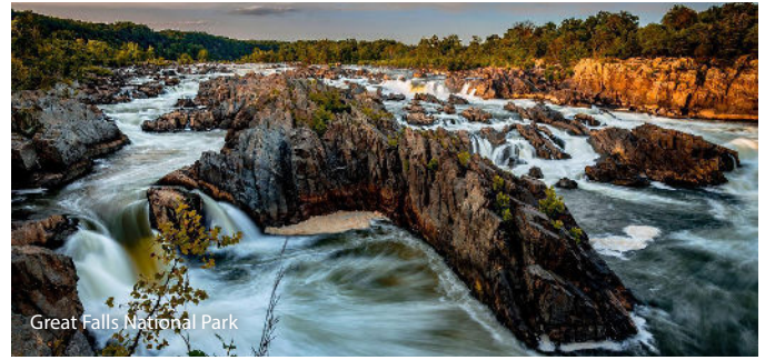
Great Falls National Park

Manassas National Battlefield Park - “Where the Southern Victories Tested the Northern Resolve”. On July 21, 1861, two armies clashed for the first time on the fields overlooking Bull Run. Heavy fighting swept away any notion of a quick war. In August 1862, Union and Confederate armies converged for a second time on the plains of Manassas. The Confederates won a solid victory bringing them to the height of their power.