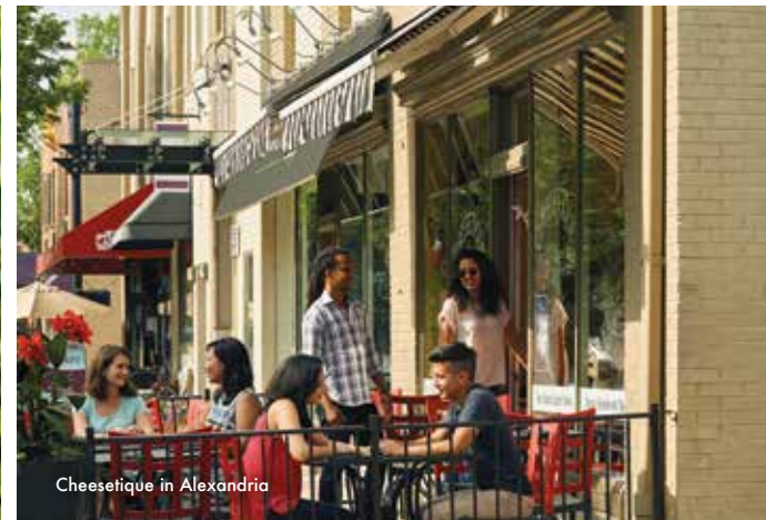
Cheesetique in Alexandria