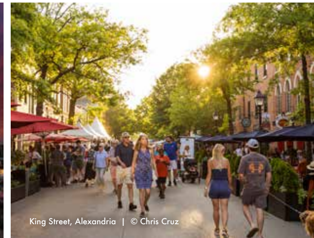
King Street, Alexandria