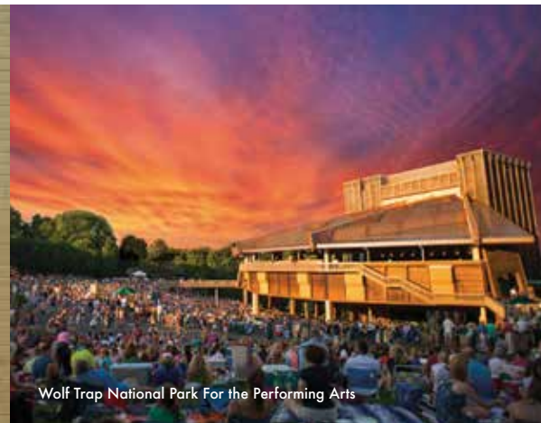
Wolf Trap National Park For the Performing Arts