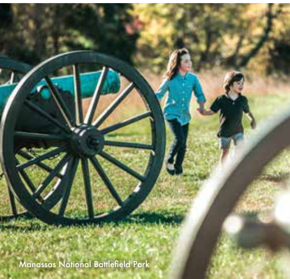
Manassas National Battlefield Park