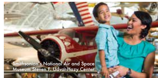
Smithsonian's National Air and Space Museum Steven F. Udvar-Hazy Center