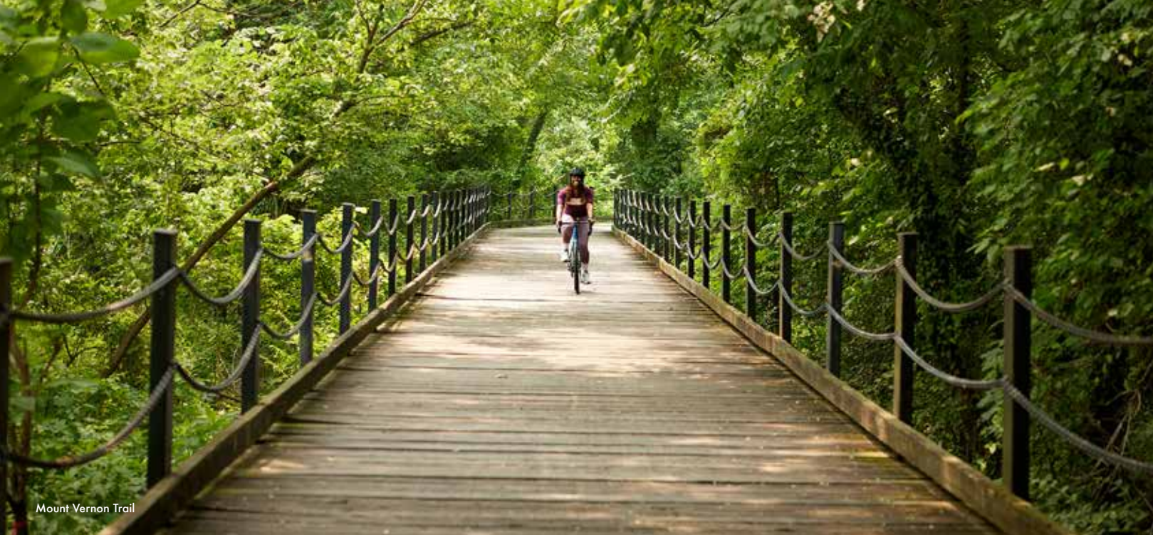
Mount Vernon Trail