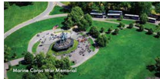
Marine Corps War Memorial