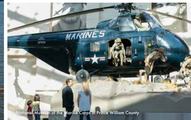
National Museum of the Marine Corps in Prince William County