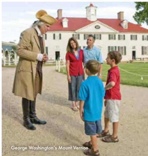
George Washington's Mount Vernon