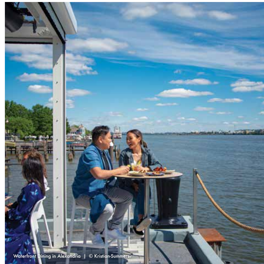
Waterfront Dining in Alexandria

With so much to do, exploring Virginia’s Cultural Region also takes you outside. Bring your bicycle (or rent one via Capital Bikeshare) and take to the miles of bike trails that traverse the region, or ride alongside the shores of the Potomac River for amazing views of the DC monuments and Tidal Basin. Take to the water yourself for a scenic kayak ride or aboard a relaxing dinner cruise. Enjoy a round of golf, a leisurely hike in the woods, or relax with a picnic overlooking acres of vineyards. The possibilities are endless.