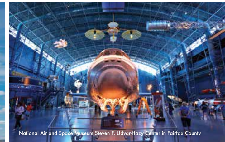
National Air and Space Museum Steven F. Udvar-Hazy Center in Fairfax County