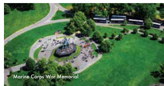
Marine Corps War Memorial