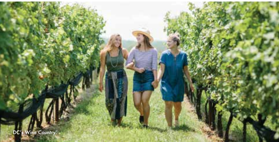
DC’s Wine Country 2