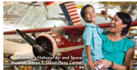
Smithsonian's National Air and Space Museum Steven F. Udvar-Hazy Center