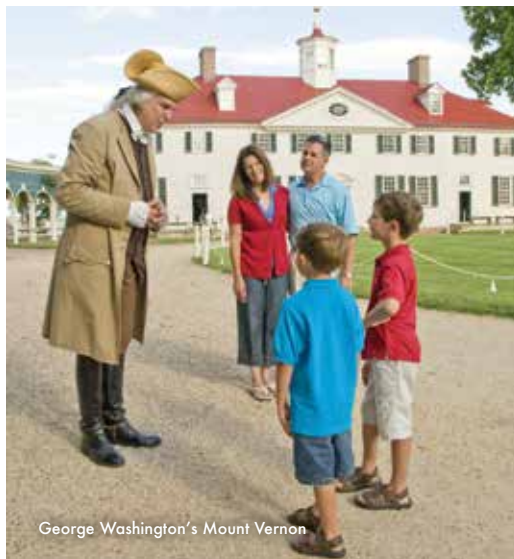
George Washington's Mount Vernon