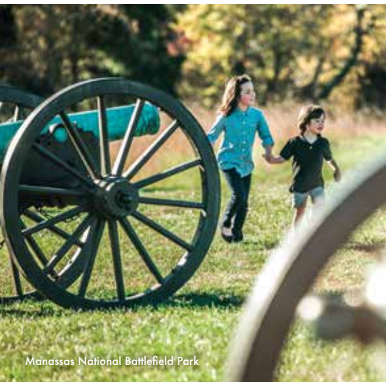
Manassas National Battlefield Park