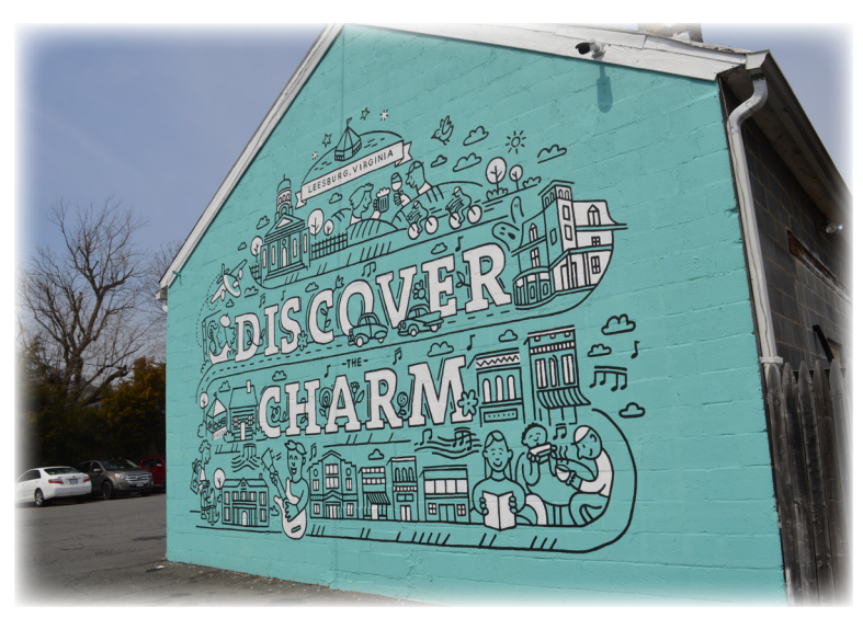
Pictured: Historic Downtown Leesburg

Depart from Dulles International Airport, Dulles, VA