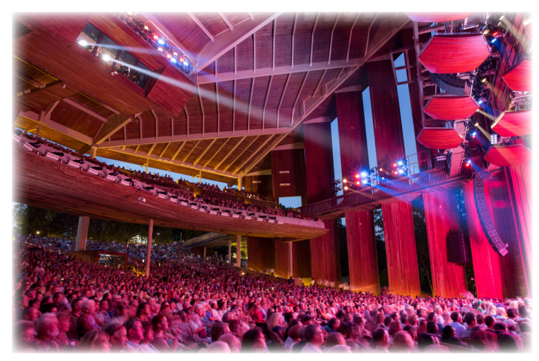
Pictured: The Filene Center at Wolf Trap

Through a wide range of artistic and educational programs, Wolf Trap enhances our nation's cultural life and ensures that the arts remain accessible and affordable to the broadest possible audience. A typical season at Wolf Trap includes everything from pop, country, folk, and blues to orchestra, dance, theatre, and opera, as well as innovative performance art and multimedia presentations at one of the site's four main venues: the majestic Filene Center indoor/outdoor amphitheater, the intimate space at The Barns at Wolf Trap, the family-pleasing Children's Theatre-in-the-Woods, or the Center for Education.