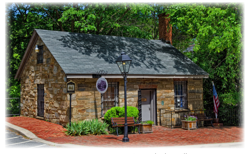
Pictured: The Mill House Museum

Don't Miss: Mill House Museum - The Mill House Museum is part of the last remaining structure from the eighteenth century Merchants Mill that once made Occoquan a bustling center for water trade. The first automated grist mill in the United States, Merchants Mill put Occoquan, VA on the map as a thriving industrial town, before the town burned down in 1924. You can learn more about the mill and the Historic Town of Occoquan while perusing the original photographs and artifacts on exhibit, many of which have been donated by the families that still reside in this small riverside town.