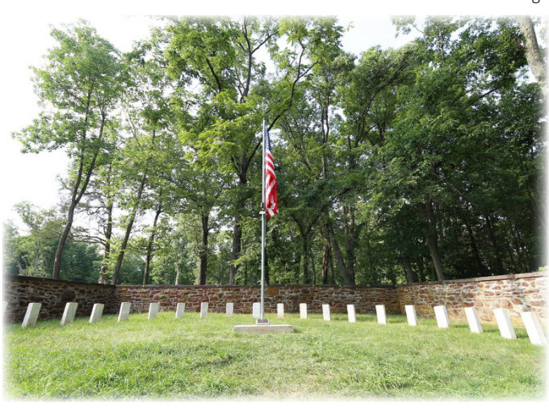
Pictured: Pictured: Ball's Bluff Battlefield Regional Park